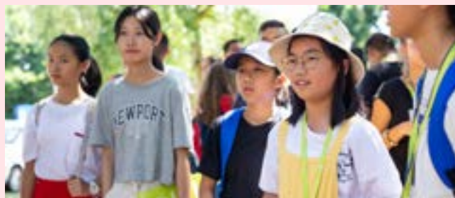
*Group transfer rates available on request.